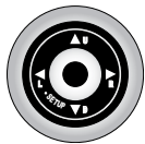
OSD Control Board