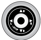
OSD Control Board