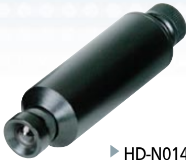
▶ HD-N014DNR 550TV Lines 1.8mm Fixed Board Lens Dimension:21(W)*21(H)*62(D)